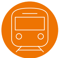
Strong inclusive economy, transport and infrastructure

The people of the Scottish Borders have the opportunities and are supported to take control of their health and wellbeing, enjoying a high quality of life