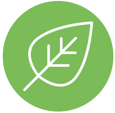
Clean, green future

We tackle climate change and we value, protect and enhance our local environment and nature, so that the Scottish Borders can be enjoyed now and by future generations