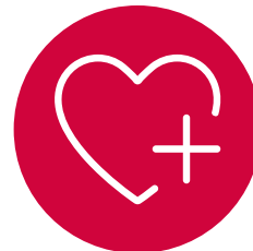
Good health and wellbeing

From child to adult, everyone in the Scottish Borders has access to high quality education and the opportunities they need to fulfil their potential