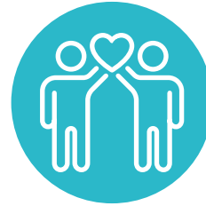
Empowered, vibrant communities

We tackle climate change and we value, protect and enhance our local environment and nature, so that the Scottish Borders can be enjoyed now and by future generations