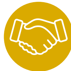
Working together improving lives

Built upon strong and effective physical and digital connections and infrastructure, the benefits of a productive and sustainable economy are widely shared, enabling us to fulfil our potential in the Scottish Borders and attract others to live, work and visit