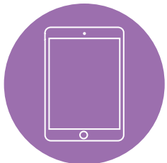
Fulfilling our potential

The Scottish Borders has thriving, inclusive communities where people support each other and take responsibility for their local area